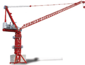
3 tower cranes with hoisting capacity of more than 3T with jib