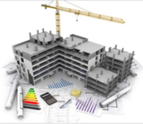
High performance engineering office (Autocad, Logitrace, Solidworks...)