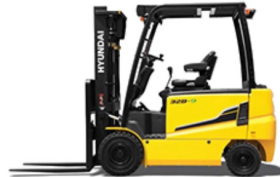
3 Clark five ton capacity devices 5T