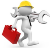
A staff of 140 internal skilled technicians