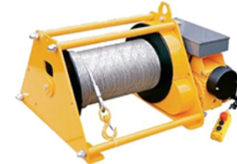
Electric winch 5T